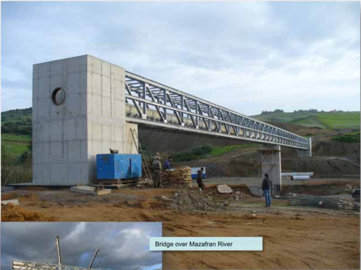
Bridge over Mazafran River