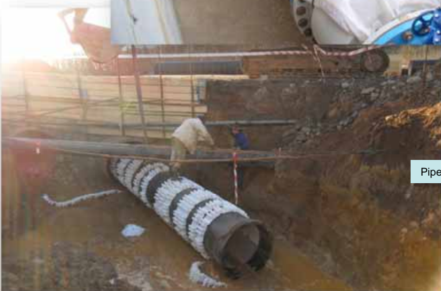
Pipes Laying under roads