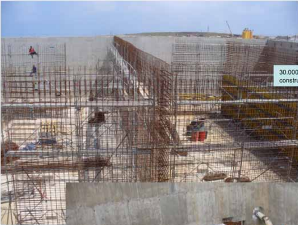
30.000 mc Tank under construction