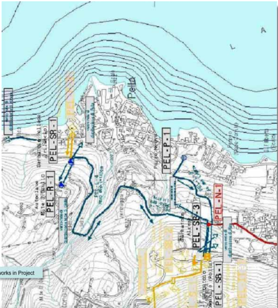
Pipes Networks in Project